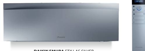
DAIKIN EMURA FTXJ-AS SILVER