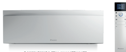
DAIKIN EMURA FTXJ-AW MATT WHITE