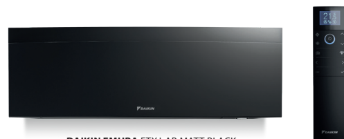
DAIKIN EMURA FTXJ-AB MATT BLACK